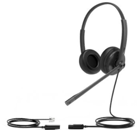
YHS34/YHS34 Lite Dual