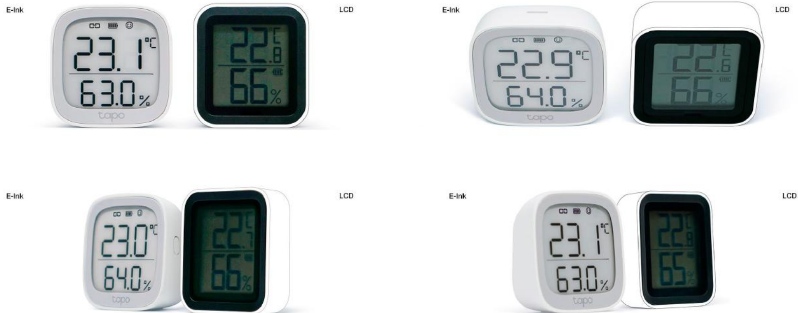
Comparison between an E-ink display and a backlit display.

Features a 2.7" E-ink display that reads like real paper. No screen glare and daylight readable with a 180 degree viewing angle.